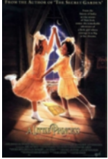
A Little Princess

Non-Profit Organization U.S. Postage Paid Nashua, NH Permit No. 999